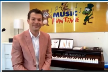
VIRGIL LUPU FORTE MUSIC SCHOOL

MUSIC FUNTIME CLASSES FORTE MUSIC SCHOOL